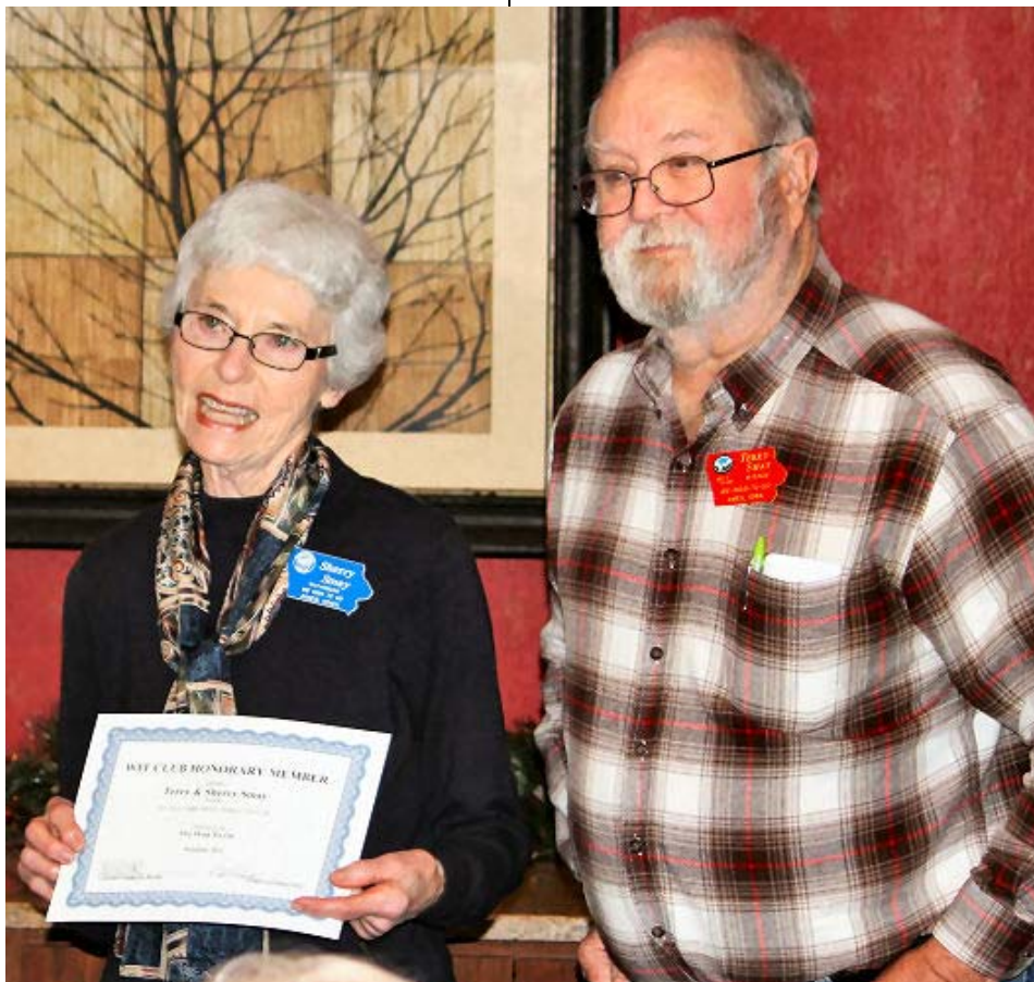
The Smays conclude 16 years of active WIT Membership