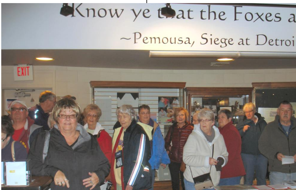
We-Wan-To-Gos tour the Meskwaki Indian Museum

Saturday evening we dined in style at the infamous Rube's Steak House in Montour.