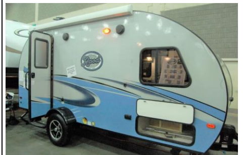
Forrest River's 'R-Pod'

As a result, Forest River withdrew its suit against Winnebago. According to an article in RVPro today, "Overall, more specific